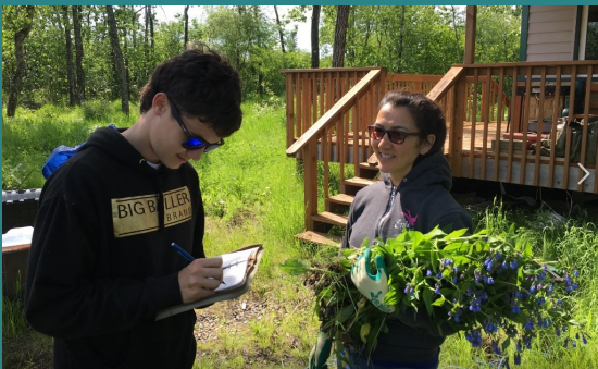
Peltola Fish Camp