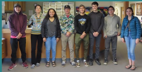
2019 ONC Crew

Compared to 2018, more fish camps reported to have met their sockeye and Chinook salmon harvest goals this year. The majority of respondents who did not meet their harvest goals for sockeye or Chinook salmon attributed it to not having a dependable boat, hot weather and supporting many families. Many respondents attributed not meeting their chum salmon goals to a late and weak chum salmon run.